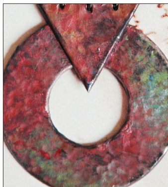
Hammered Copper technique